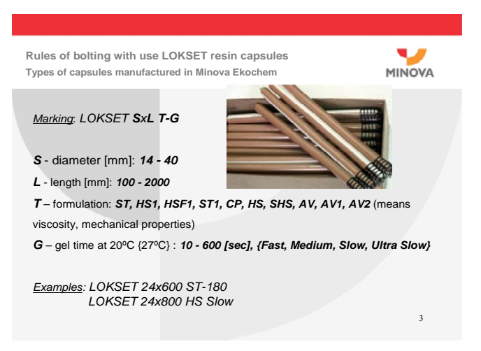
Figure 2 - Types of two-component mixture capsule manufactured by "Minova"

Rockbolts type Fiberglass bolt GRP K60, with diameter d = 27 mm and l = 1800 mm long, with support plate of fiberglass GRP Plate R=200 mm, with nut GRP Nut manufactured by FIREP, Switzerland and fast-bonding two-component mixture-resin type Lokset 28x250 mm HS Fast (fast bonding - setting time t = 13-18 s) and Lokset resin 28x600 mm HS Slow (slow bonding – bonding time t = 70-200 s), manufacturer MINOVA Ekochem, Poland (Figure 2) were installed in the boreholes. Rockbolts and capsules have all necessary international certificates (Atlas Copco, 2009).