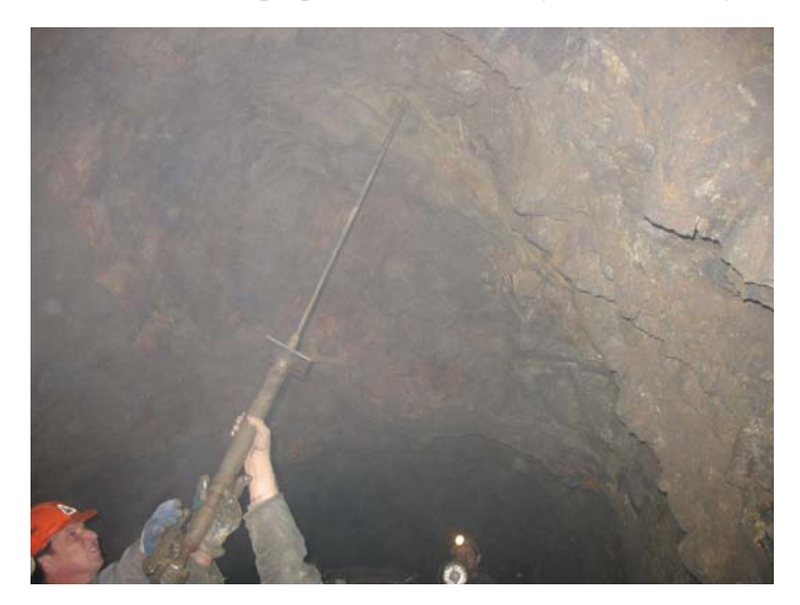
Figure 3 - Mounting of the fiberglass rockbolt into the excavation drift side wall

After that, rockbolts mounting, using the adapter mounted on the rotary hammer, was done. The average time for placing was max. t = 30 s. After installing and setting resin capsules, they are now "pulling out" the rockbolts, due to check the rockbolt capacity. Loading capacity of rockbolts was measured by the hydraulic cylinder, so called "pull tester". First, we made the determination of rockbolts tensile strength, and then we check the properties of tear sternght of the fiberglass rockbolts.