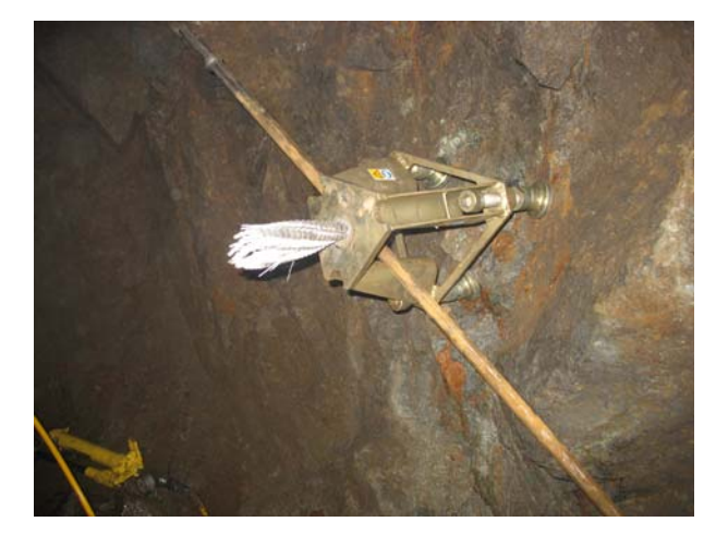
Figure 4 - Broken fiberglass rockbolt

Using the coefficient of safety v = 1.5, it was concluded that the investigated fiberglass rockbolts can be used to support the stopes and underground rooms in the "Rudnik" mine, where, by the appropriate calculation, a bearing capacity of min. F = 77 kN, is required (Mining Institut, 2009).