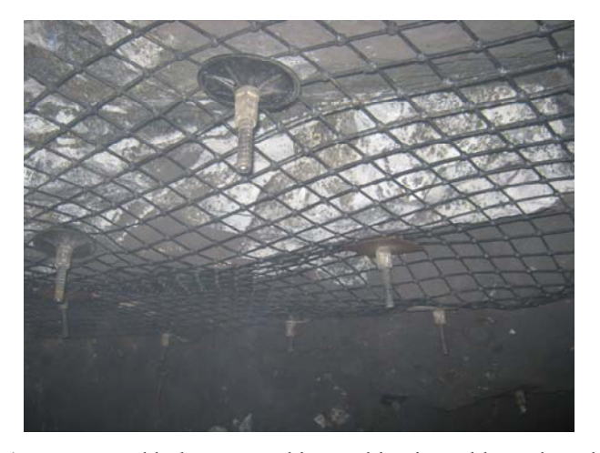
Figure 5 - Rockbolts mounted in combination with steel mesh

As noted, fiberglass rockbolts with two-component mixture - resin are installed in excavated drifts from which later are to be formated stopes, where the working environment is disturbed by cracks and faults, and where there is a potential risk of falling material from the stope roof. Currently, in the "Rudnik" mine, about 300 pieces of fiberglass rockbolts with two-component mixture (resin) per month has been installed. Some excavated area of ~200 m<sup>2</sup> are fully secured by this type of support, with excellent results in terms of stability and security in work. In special cases, where the separation of smaller pieces of material from the roof is observed, the rockbolts are mounted in combination with steel mesh, shown in Figure 5.