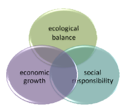
Figure 1 - Goals of mining risks reduction strategies

Goals of mining risks reduction strategies (Figure 1) are: economic growth, ecological balance and social responsibility.