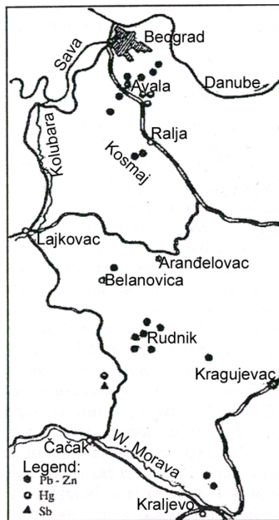
Figure 1 - Situation map of Šumadija mining area (Simić, 1951)

1951). Figure 1 shows situation map of Šumadija mining area. The mining activities of Avala are more diverse than any other in the region of Šumadija because once upon a time it was the place where mercury, silver-bearing lead and, most probably, copper were exploited (Simić, 1951).