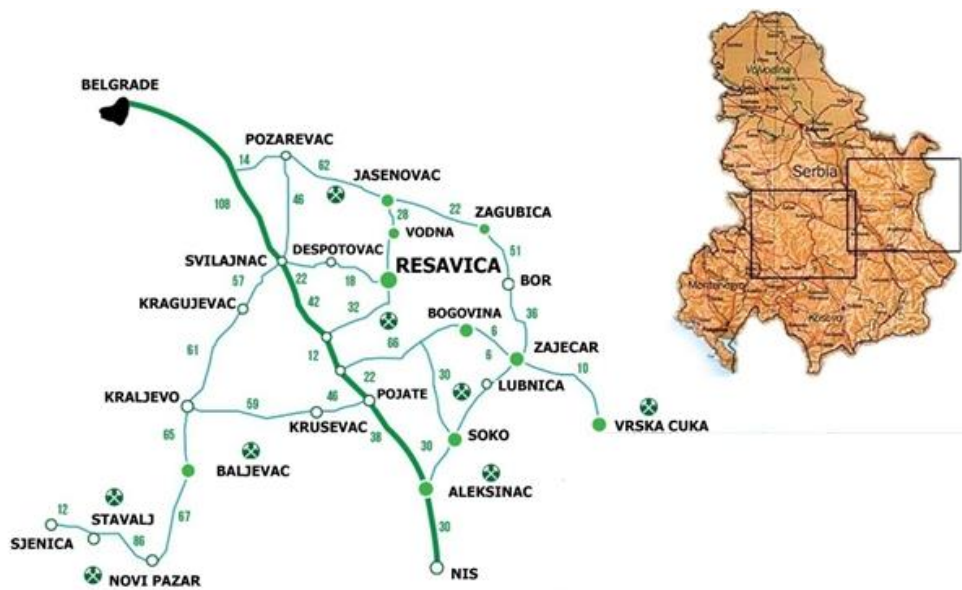
Figure 1. Mines of PCUEC Resavica

Public Company for the Underground Exploitation of Coal Resavica (PCUEC Resavica)- Serbia is a very complex system for coal exploitation and processing in Serbia. This system has eight mines located in central part of Serbia (Figure 1).