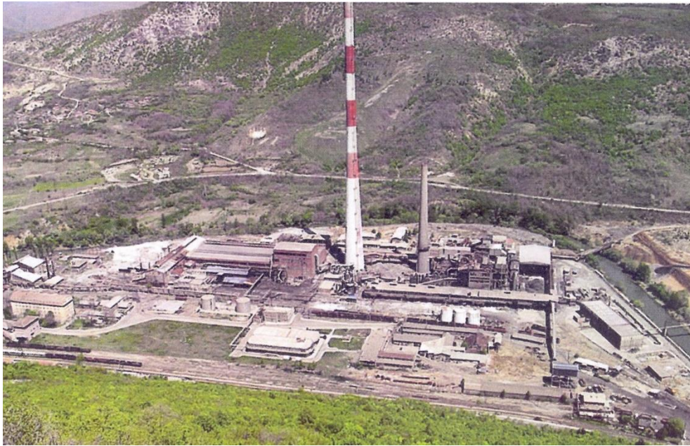
Figure 3 Industrial grounds in Zvečan after the year 1990