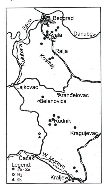
Figure 1 - Situation map of Šumadija mining area (Simić, 1951)

1951). Figure 1 shows situation map of Šumadija mining area. The mining activities of Avala are more diverse than any other in the region of Šumadija because once upon a time it was the place where mercury, silver-bearing lead and, most probably, copper were exploited (Simić, 1951).