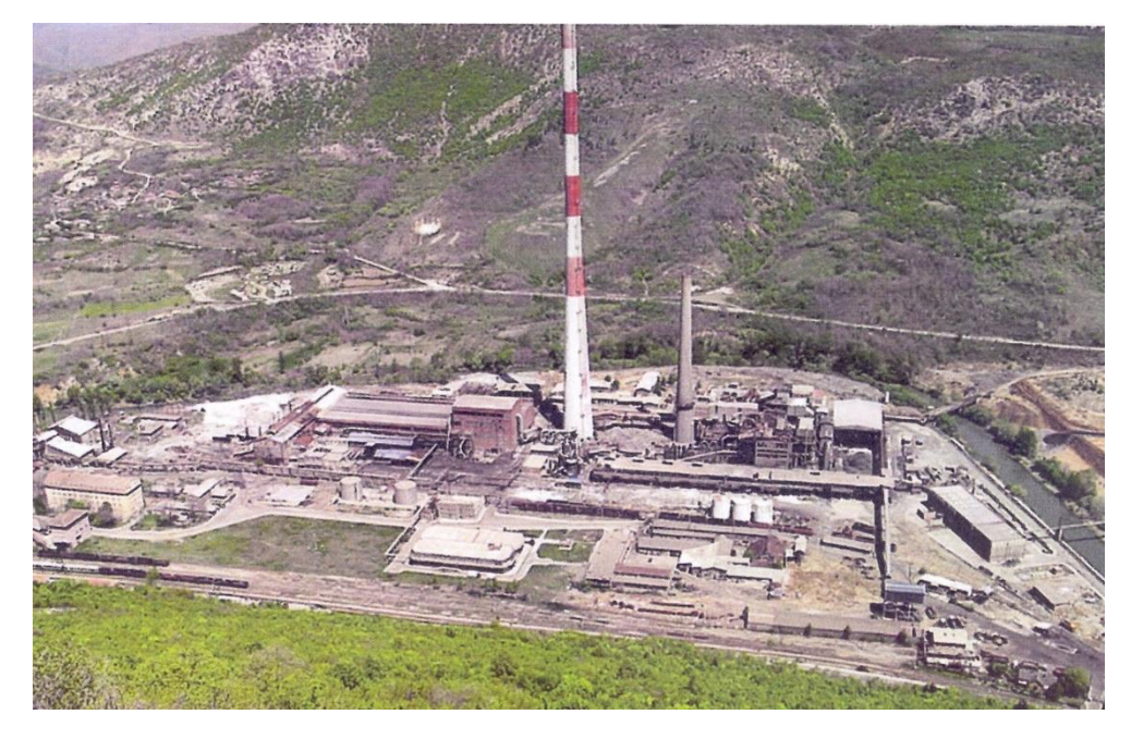
Figure 3 Industrial grounds in Zvečan after the year 1990